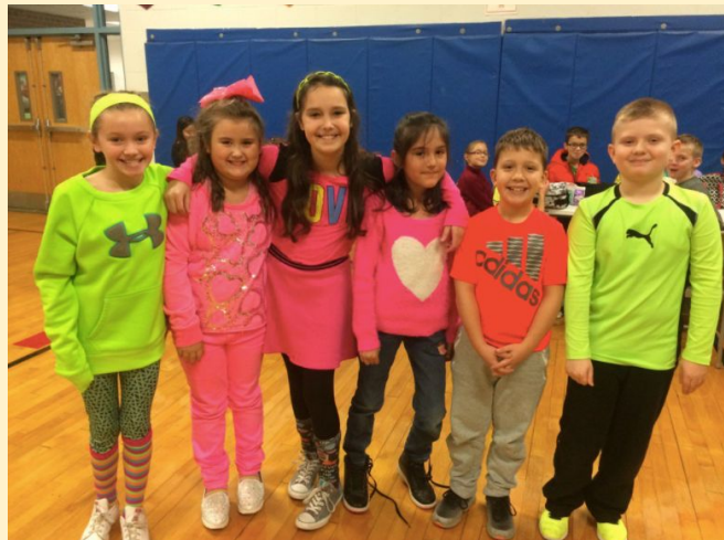
Franzen students wearing neon for the JDRF Fundraiser!

Be sure to check out what your fellow colleagues are doing by searching our hashtags #weareitasca10 for fun updates and #D10learns for teaching and learning opportunities!